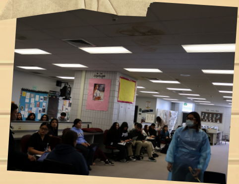
Health put their medical and history knowledge to practice this week during a mystery diagnosis activity!