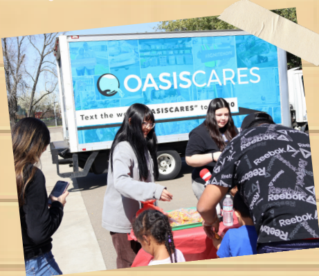
Weber Head Start hosted a Literacy Faire March 8th. Families partook in activities, gained resources and more at this event.